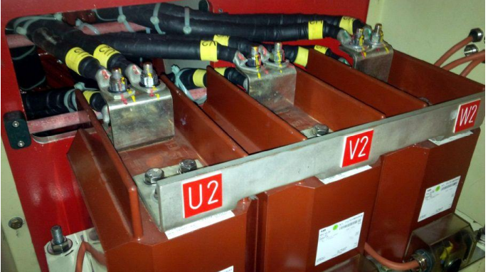
Neutral point with neutral point converter